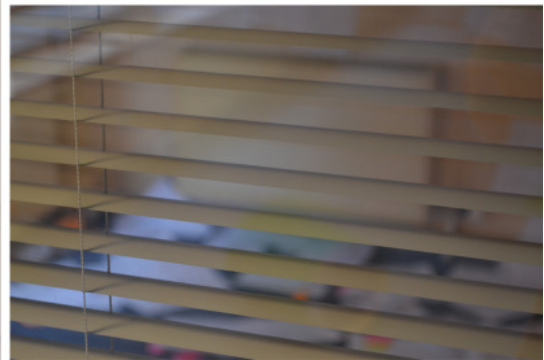
Office Simulation Space, performance and installation, JOBCENTRESUPERPLUS (March 2013)